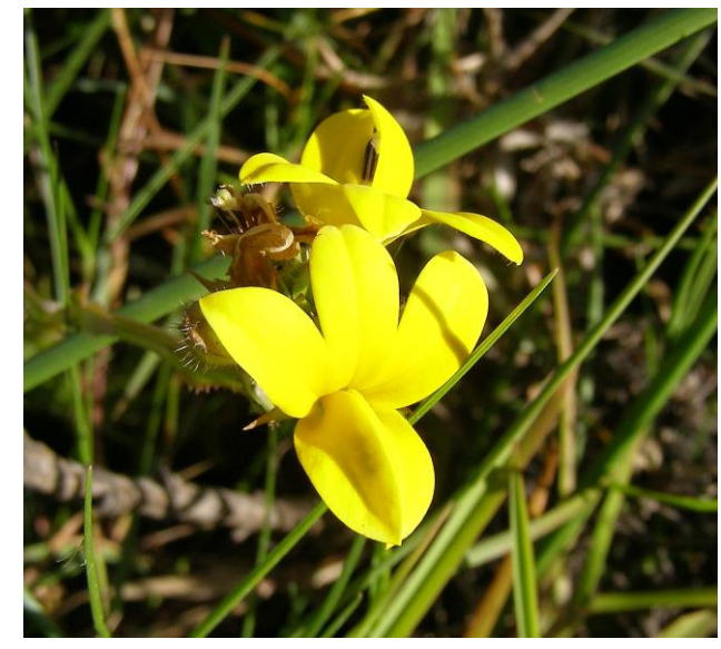
Monopsis Lutea Yellow Lobelia