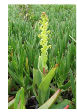
Satyrrium odorum Soet Trewwa