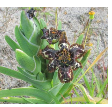
Ferraria crispa Seaspider Iris The flower only lasts for 1 day.