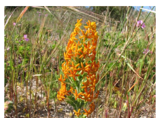
Manulea tomentosa Sea Fingerphlox