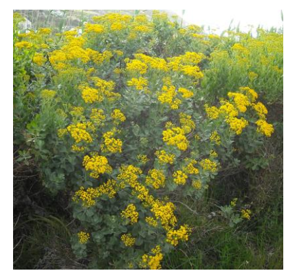
Senecio halimifolius Tobacco Bush