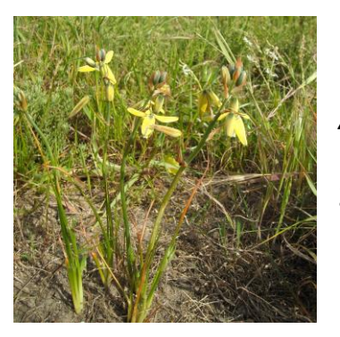
Albuca cooper Slime Lily (Geldbeursie)