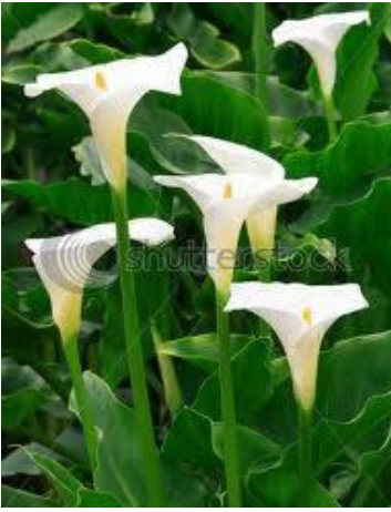
Zantedeschia aethiopica Arum Lily The rhizomes are eaten by porcupines, who always leave a bit behind to regrow. The tiny Arum Lily Frog ( Hyperolius horstockii ) hides in the flowers.