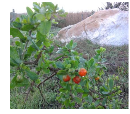
Lycium ferocissimum Snake Berry – This plant appears to be dead in summer.