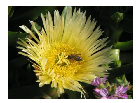
Carpobrotus edulis Sour Fig