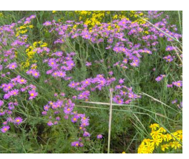
Senecio elegans Greater Purple Ragwort