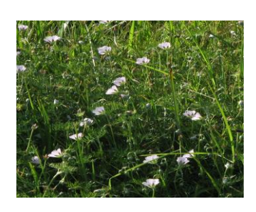
Geranium incarnum Cape Geranium