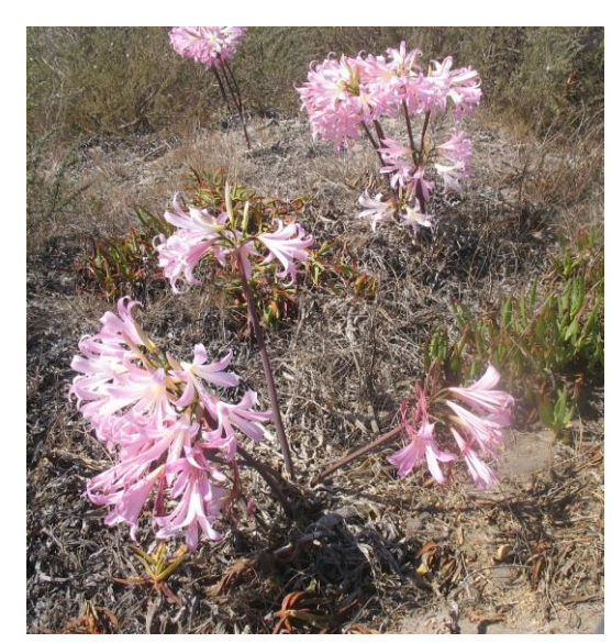
Amaryllis Belladonna March Lily-It has no leaves while flowering