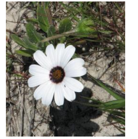
Dimorphotheca pluvialis Rain Daisy