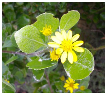
Chrysanthemoides moniliferum Chysanthemoides monilifera