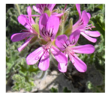
Pelargonium capitatum Rose scented Sea stork's Bill